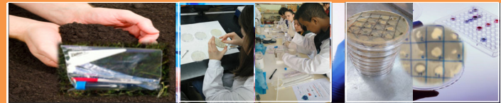
1. Exploring microbial diversity